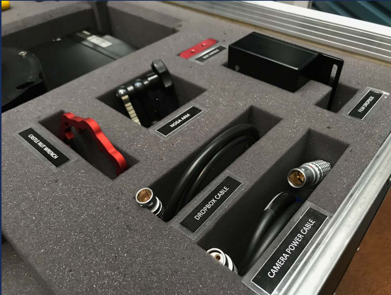
"Tower of Power" Head Case Interior