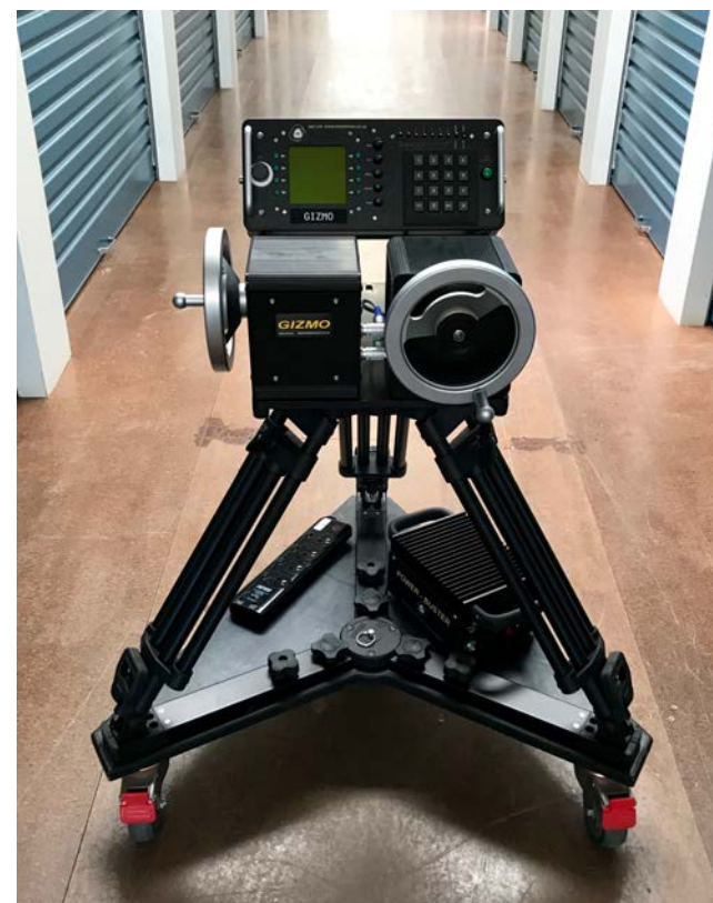
Legs and wheeled base sold separately